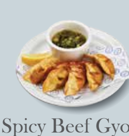
Spicy Beef Gyoza