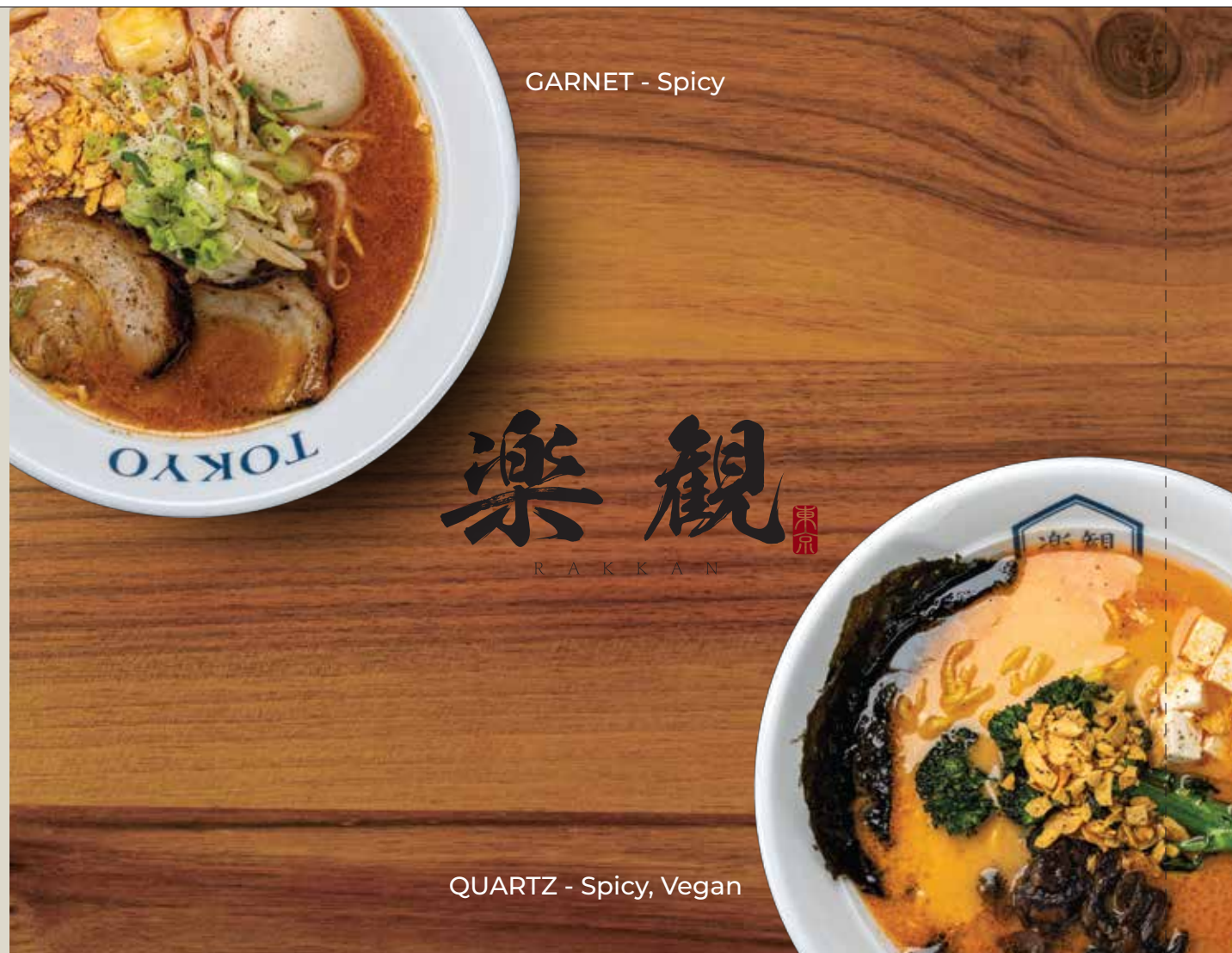
GARNET - Spicy

*We serve products that may contain shrimp, eggs, soybeans, wheat. *These items may be served raw and/or undercooked or contain raw or undercooked ingredients. *Consuming raw or undercooked seafood or EGGs may increase your risk of foodborne illnesses. Please notify your server if you have any food allergies before placing your order. *Fried items are fried in the same vegetable oil as RAKKAN fried products. All noodles are boiled in the same boiling water. No gluten-free ramen available. No Msg added. There would be an added 20% auto gratuity for parties with 6 or more guests.