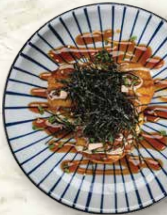
Crispy Pork Gyoza (3 pcs)