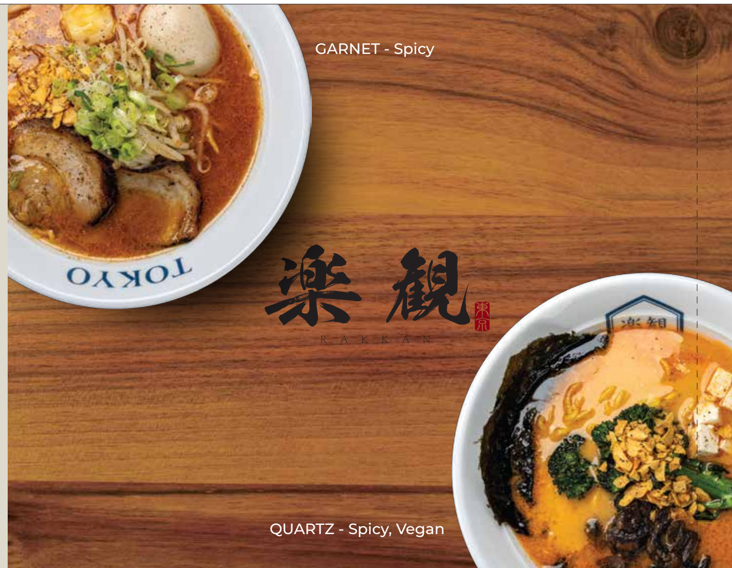
GARNET - Spicy

We serve products that may contain shrimp, eggs, soybeans, wheat. *These items may be served raw and/or undercooked or contain raw or undercooked ingredients. Consuming raw or undercooked seafood or EGGs may increase your risk of foodborne illnesses. Please notify your server if you have any food allergies before placing your order. Fried items are fried in the same vegetable oil as RAKKAN fried products. All noodles are boiled in the same boiling water. No gluten-free ramen available. No MSG added.