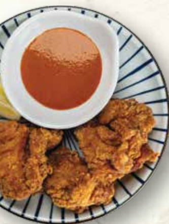
Chicken Karaage (3 pcs)

Order any ramen or rice bowl at regular menu price and add one of these appetizers at special lunch prices! Limit one appetizer per ramen or rice bowl.