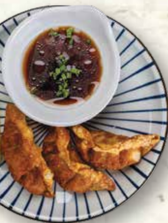
🌿 Crispy Vegan Gyoza (3 pcs)